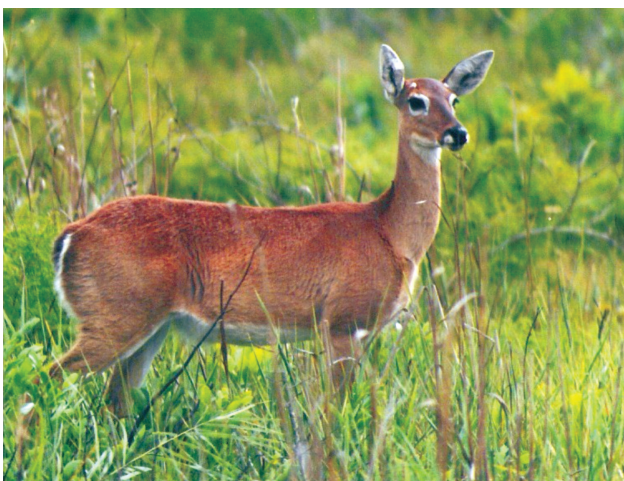
Figure 2 - Pampas deer doe from Emas National Park, Brazil.