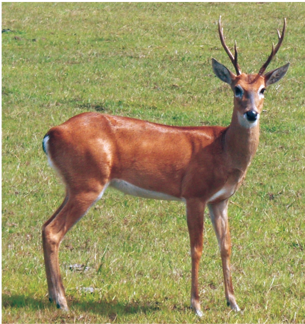
Figure 1 - Pampas deer male from Pantanal, Brazil.

The Pampas deer has well developed preorbital scent glands with a characteristic strong smell reminiscent to garlic or onion. In fact, the name “Yoam-shezée” given to this species by the Puelches, means “smelly or stinking deer” (Cabrera and Yepes 1960). Other glands present are the vestibular nasal and metatarsal. Metatarsal glands may or may not be present (Jackson 1987). They were not detected by Miller (1930) or Langguth and Jackson (1980), but were detected by Hershkovitz (1958) and Bianchini and Delupi (1979).