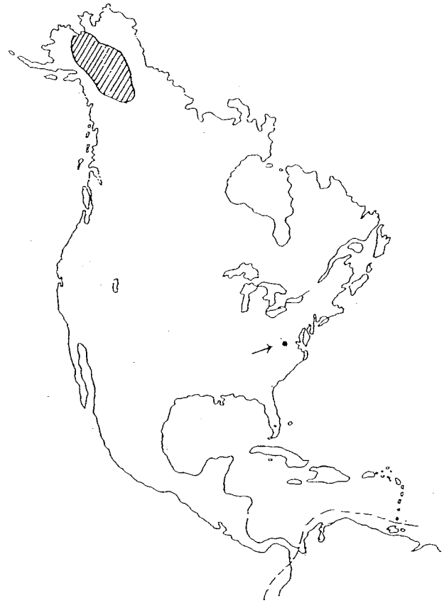
Fig. 2. Outline map of North America, showing primary range of Escaryus ethopus in Canada and Alaska (shaded), and location of site in the Virginia Blue Ridge (arrow).

Heretofore this species has been recorded only from Alaska and Yukon Territory, Canada (Pereira & Hoffman, 1993, Map 1). Although widely disjunct distributions between the Appalachians and western North America have long been known, they have been almost invariably at the generic level. The present case involves a separation of more than 2600 mi/4160 km and displacement far to the south from the subarctic primary area (Fig. 2). Fragmentation of a once continuous North American range may be invoked as the only plausible explanation; the existence of other small disjunct populations may be reasonably assumed.