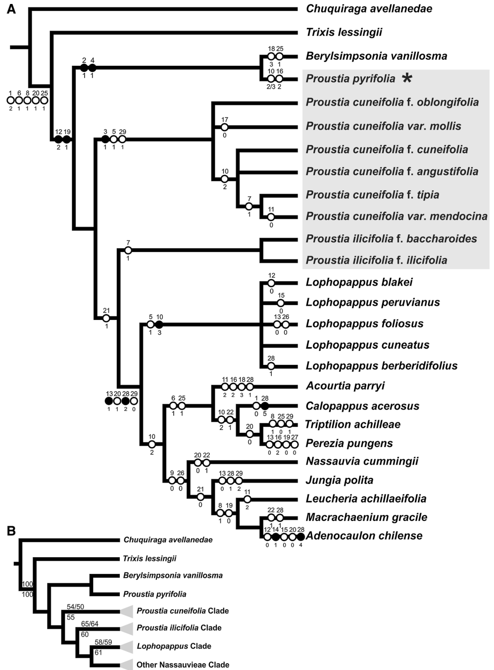
Fig. 3 a One of the six cladograms obtained from the analysis of the morphological data set. Black circles indicate synapomorphies, white circles indicate homoplastic characters. Gray surface includes current Proustia species. b Reduced strict consensus of six equally most parsimonious trees resulting from morphological data set. Numbers above branches are bootstrap values (Absolute, AB/Group present/contradicted, GC); numbers below branches are Jackknifing values (bootstrap values below 50 % not shown). Asterisk indicates the type species of Proustia

the analysis and all were parsimony informative. The six cladograms varied in two clades, the Proustia cuneifolia clade and the Calopappus-Triptilion-Perezia clade, which showed different internal arrangements of their lineages. Apart from these two clades, the other relationships recovered by the six trees were identical. Only selected clades, however, obtained support values \geq 50 . The strict consensus of the six trees (Fig. 3b) retrieved Proustia polyphyletic. Independently, each species of Proustia was