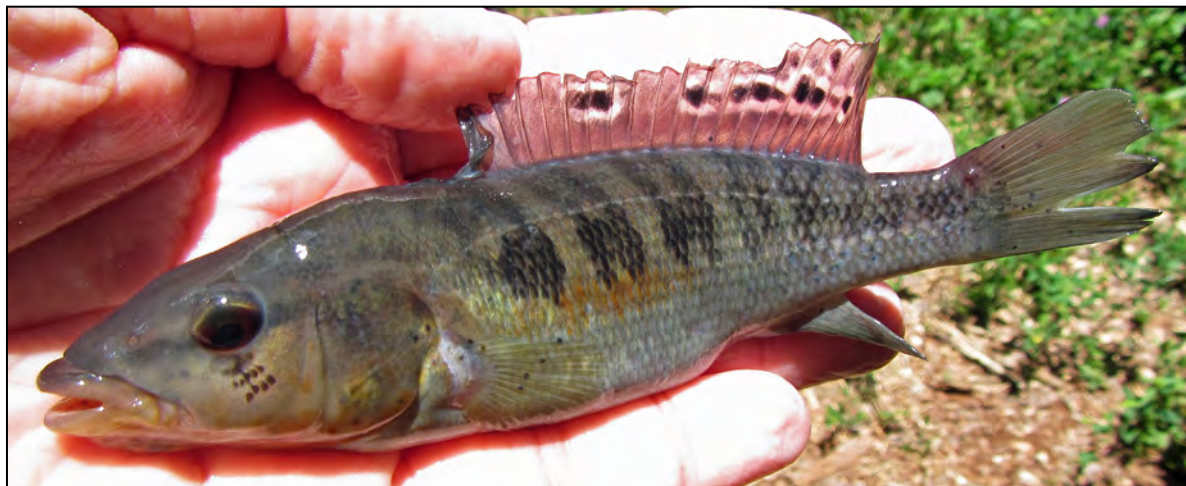
fig. 1. Adult female of Crenicichla yaha (MLP 11215) in breeding coloration. Arroyo Falso Uruguay-i. Note lack of spotting on body distinguishing C. yaha from C. tesay . Note orange coloration on flank also distinguishing C. yaha from C. tesay , but similar to sympatric C. ypo and all related species in the Middle Paraná. Note black elongated spot in dorsal fin with white margin as in all related species in the Paraná/Iguazu (including C. tesay ) except the sympatric C. ypo (where there is a orange band in ventral portion of the dorsal fin and a black band above it without a white margin). This character difference in the dorsal fin from the sympatric C. ypo suggests sexual selection and species recognition.

tesay (usually whole more greyish) and 6) slightly less scales in E1 row. Distinguished from the other molluscivorous species C. taikyra by points 4 and 5 (point 2, breeding coloration of females, is not known in C. taikyra ), by having a distinctly more robust head and body (both almost without overlap) and by having distinctly less scales in E1 row (also without overlap). Distinguished from all other species in the C. mandelburgeri group by the molluscivorous-associated characters (robust LPJ, robust LPJ teeth, robust head with short jaws and hypognathous mouth). Distinguished from all species in the C. missioneira group (that also include molluscivorous species) by well developed suborbital stripe (vs. very weakly developed and diffuse, composed of a few isolated spots at best).