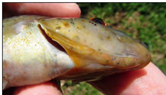
fig. 3. Detail of lower portion of head of the same female of C. yaha showing orange branchiostegal membrane distinguishing C. yaha from C. tesay and the sympatric C. ypo (where in both cases grey).