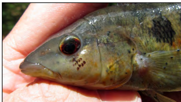
fig. 2. Detail of head of the same female of C. yaha . Note sub-terminal hypognathous mouth similar to C. tesay but different from the prognathous mouth of the sympatric C. ypo .