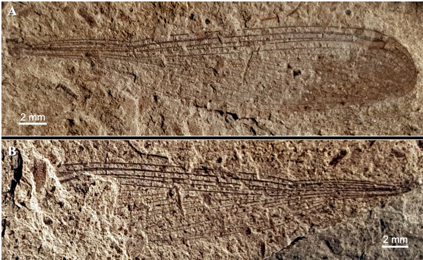
Figure 1. Photographs of the habitus of the malachite damselfly, Madres delpueblo n. gen. n. sp., holotype MAPBAR 4140 from Río Pichileufú (Río Negro, Argentina); Lutetian, middle Eocene. Part (A), counterpart (B).