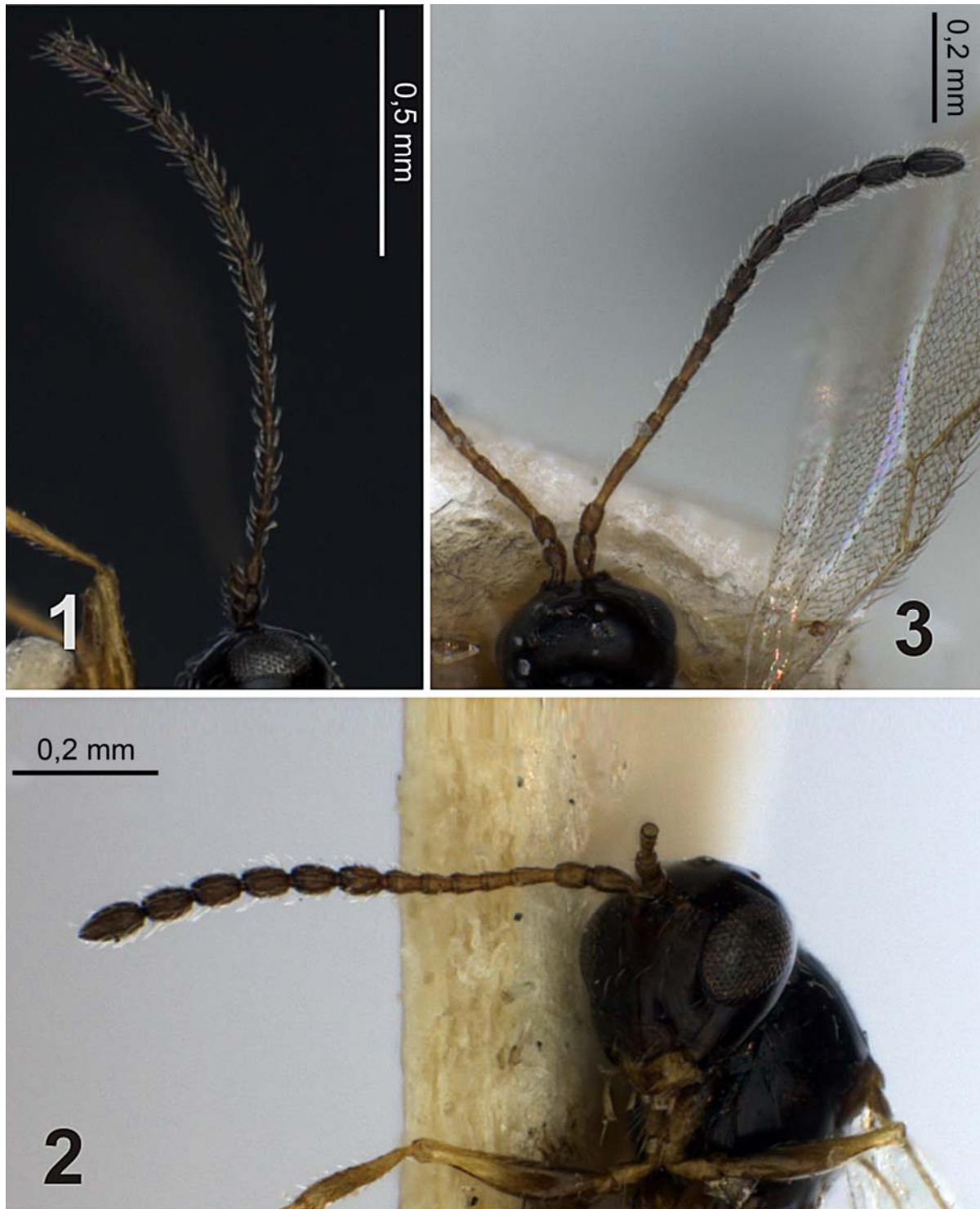
Figures 1-3. Antenna of female. 1. Hexacola hexatoma (Hartig, 1841); 2. Hexacola bifarium Quinlan, 1986; 3. Hexacola bonaerensis Reche nom. nov.