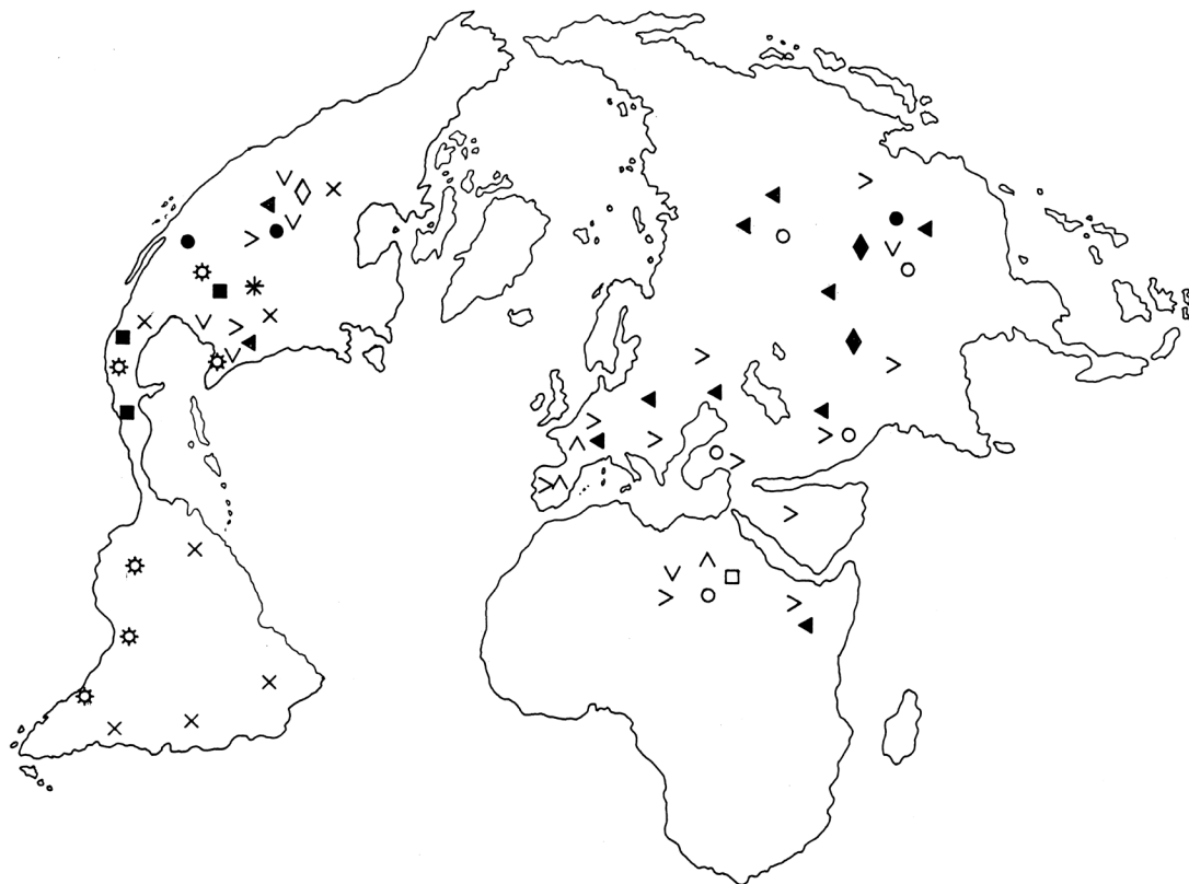
Figure 2. Map showing the distribution of gomphotheres. Symbols: □: Phiomia , North Africa; ○: Protanancus , North Africa and Asia (China, Mongolia, Turkey and Pakistan); △: Archaeobelodon , North Africa and Europe (France and Spain); ●: Serbelodon , China and North America (California and Nebraska); ∇: Amebelodon , North Africa, China, and North America; ◀: Platybelodon , East Africa, South Asia, China, Mongolia, Europe, and North America; >: Gomphotherium , North and East Africa, South Asia, China, Europe, and North America; ■: Rhyncotherium , North America; ◊: Eubelodon , North America (Nebraska); *: Gnathabelodon , North America (Kansas); ◆: Sinomastodon , East Asia, China, and Mongolia; ☼: Cuvieronius , North and South America; X: Stegomastodon , North and South America.

A major biogeographic event of the Gomphotheriinae clade is represented by the dispersal of the ancestor of