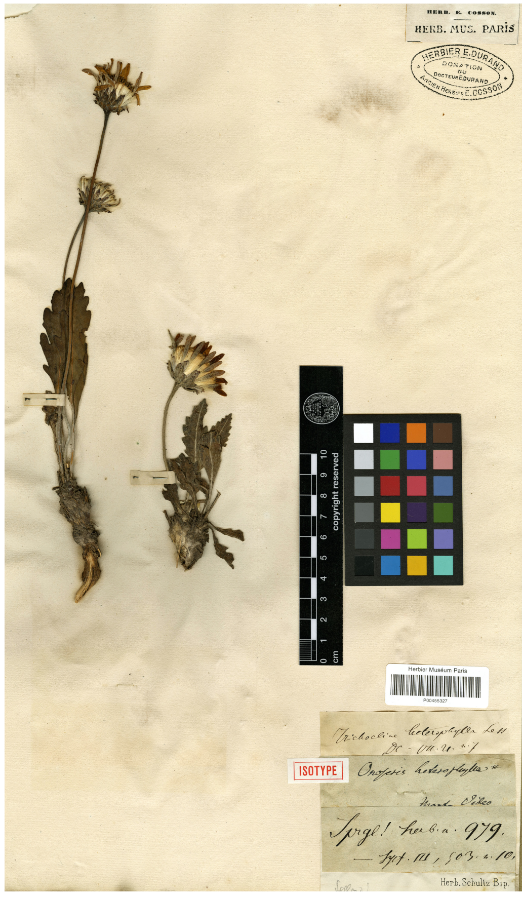
Fig. 2. Lectotype (P 00455327) of the name Onoseris heterophylla ( \equiv Trichocline heterophylla ).